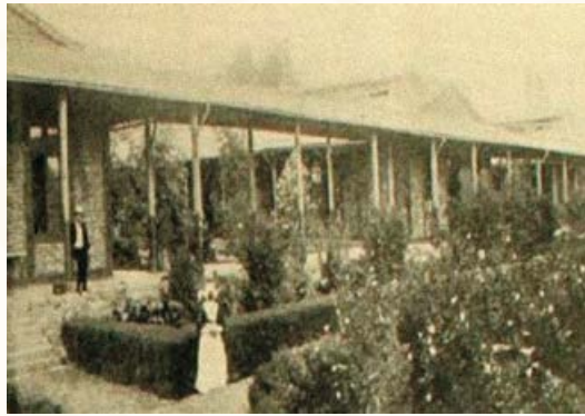
Patio Hospital San José, Revista Zig-Zag , abril de 1909