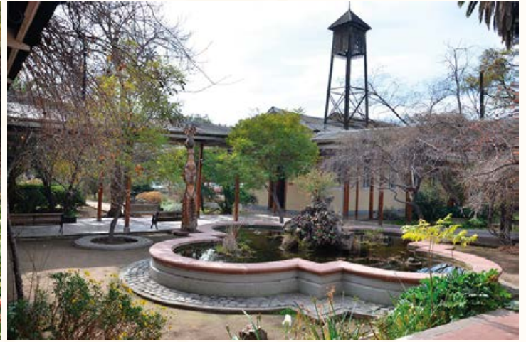
Pileta, tótem, torre de agua en patio del antiguo Hospital San José.