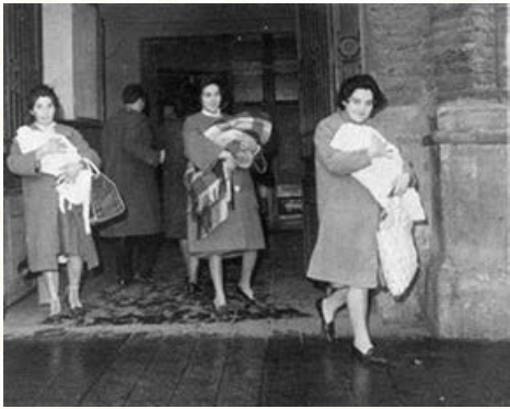
Maternidad del Hospital San José, 1964.