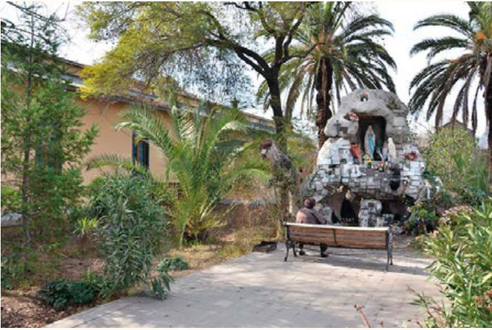
Gruta del antiguo Hospital San José.