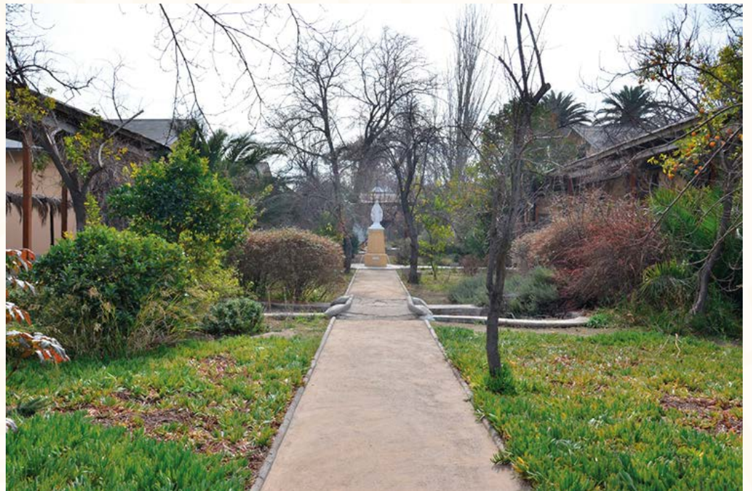
Patio del antiguo Hospital San José.