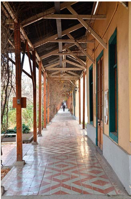
Pasillo, a la altura del teatro del antiguo Hospital San José.