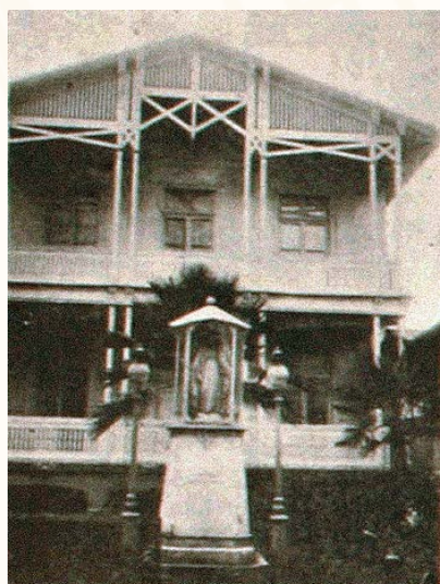
Hospital de San José, de tuberculosos