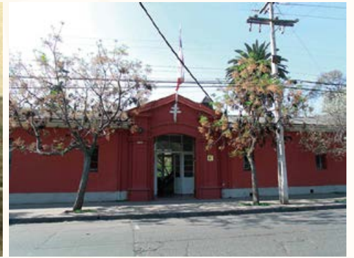
Fachada del antiguo Hospital San José.