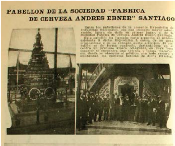
Pabellón de la Ebner en Quinta Normal. Revista Zig-Zag , diciembre de 1910.