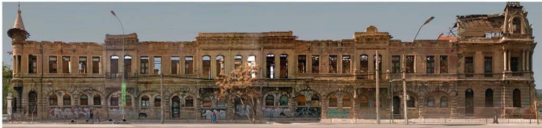
Antes y después, restauración de fachada cervecería Ebner.