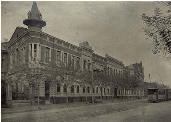
Cervecías Unidas-Independencia.