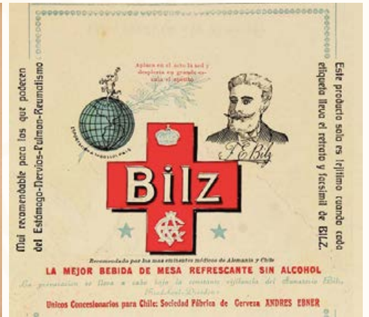
Recorte publicitario. Revista Corre Vuela , enero de 1908.