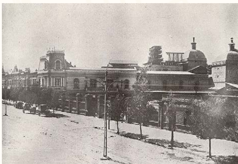
Fábrica de cerveza Independencia. Imprenta Barcelona, Santiago a la vista , 1913.

The factory was among the most prominent in the beer production business. The brewery's Pilsen was one of its most acclaimed and consumed concoctions. The factory was also the cradle of the soft drink Bilz, which was advertised as having healing properties and recommended by the first Chilean doctor, Eloísa Díaz. The factory employed more than 800 workers and its production supplied the national and international market, exporting to Peru, Ecuador and Argentina. In 1916, it passed into the hands of the Compañía de Cervecerías Unidas, a large diversified beverage company, and remained operational until 1978. The building has been a National Monument since 1984 under Decree N° 646, and has since been restored.