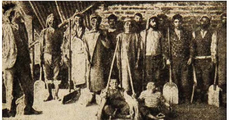
Trabajadores cervecería Ebner. El Obrero Ilustrado , julio de 1906.