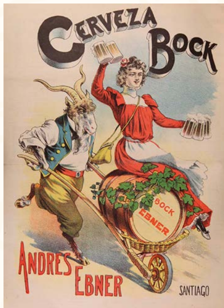
Publicidad cerveza Bock. Revista La Lira Chilena , mayo de 1904.