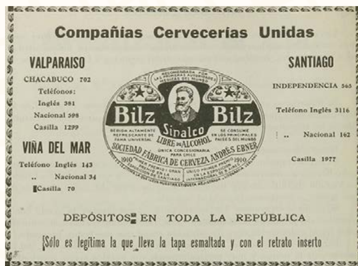
Recorte publicitario. Patronato Nacional de la Infancia, Almanaque del Patronato Nacional de la Infancia , 1921.