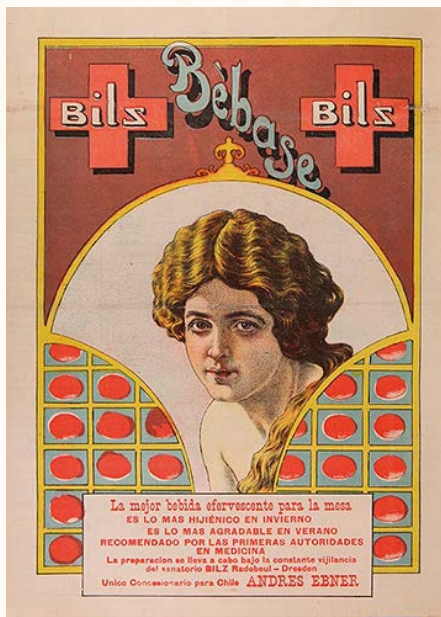
Publicidad Bilz. Revista La Lira Chilena , mayo de 1904.